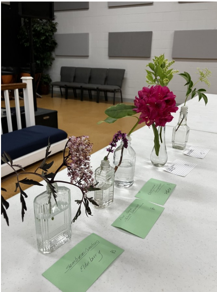
Horticulture specimens on display at the meeting.