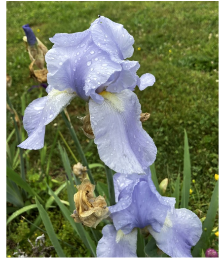
Parting shots of irises from Janet's garden